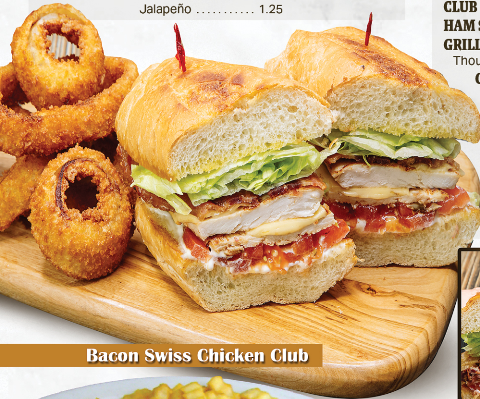
Bacon Swiss Chicken Club