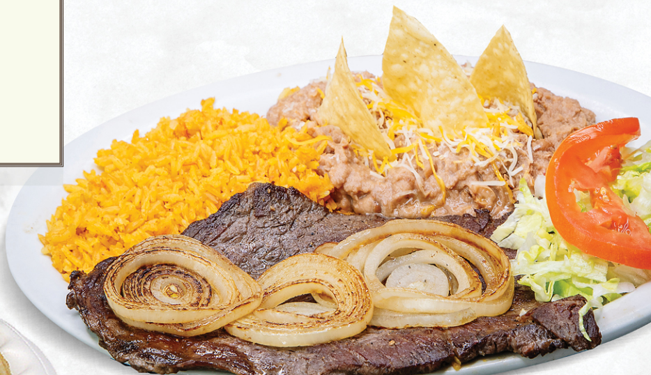
Carne Asada with Onions