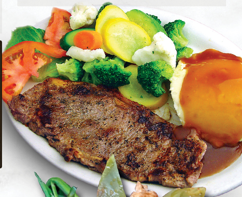
New York Steak