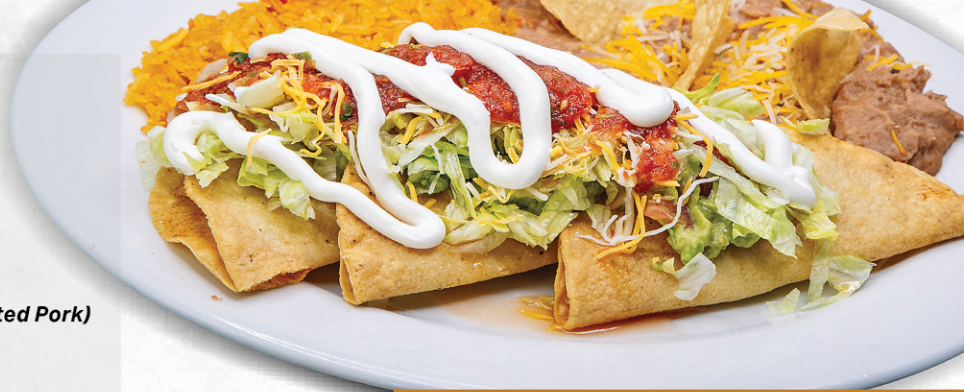
Hard Shell Tacos

Served with guacamole, lettuce, cheese, salsa and sour cream.