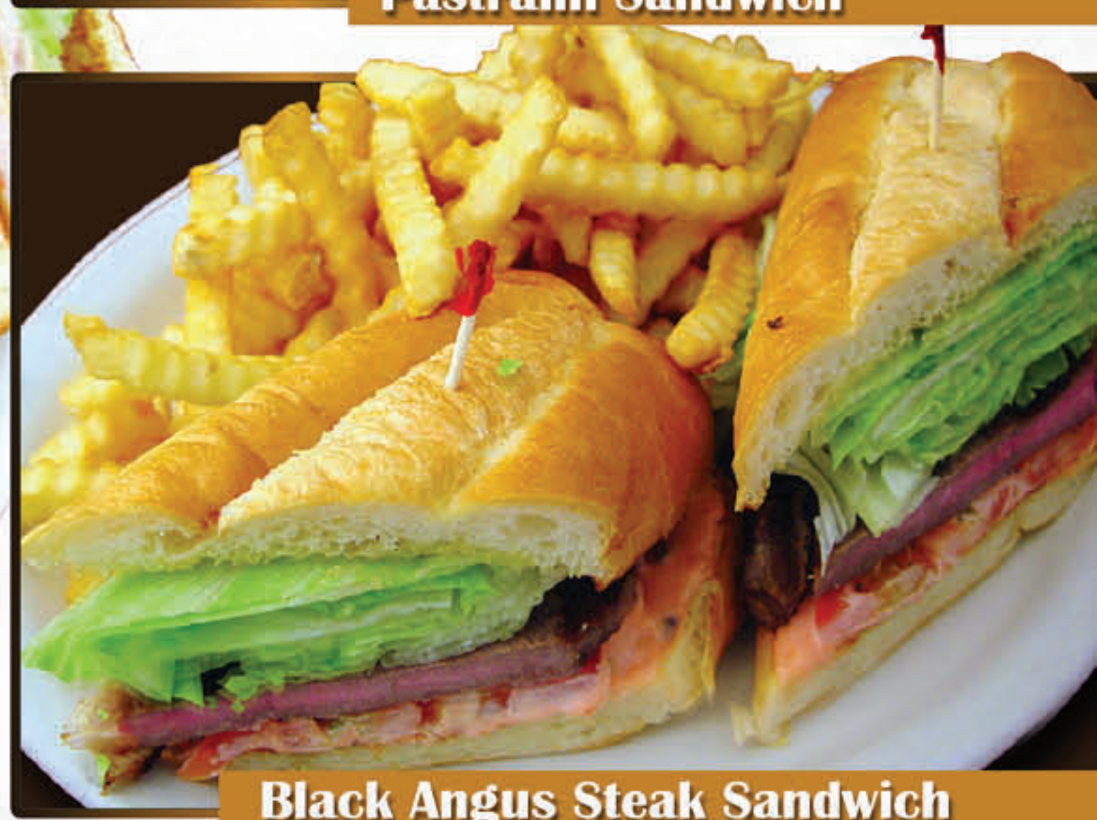
Black Angus Steak Sandwich