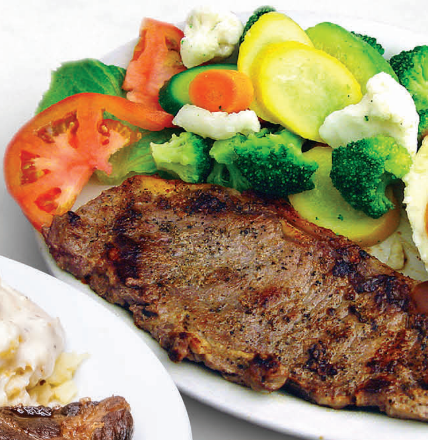
New York Steak