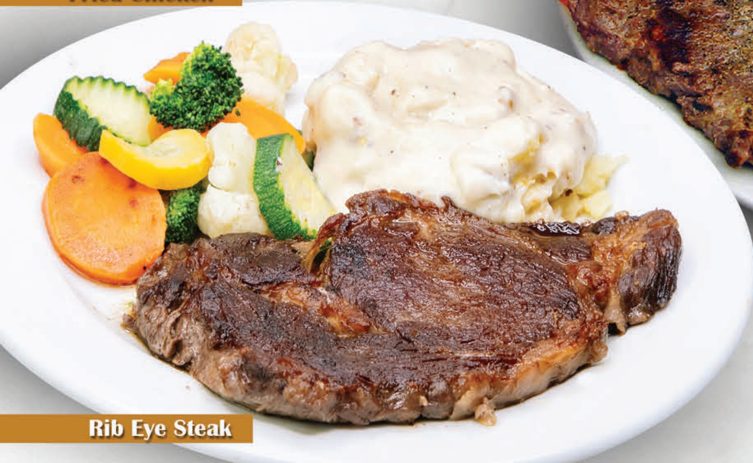
Rib Eye Steak