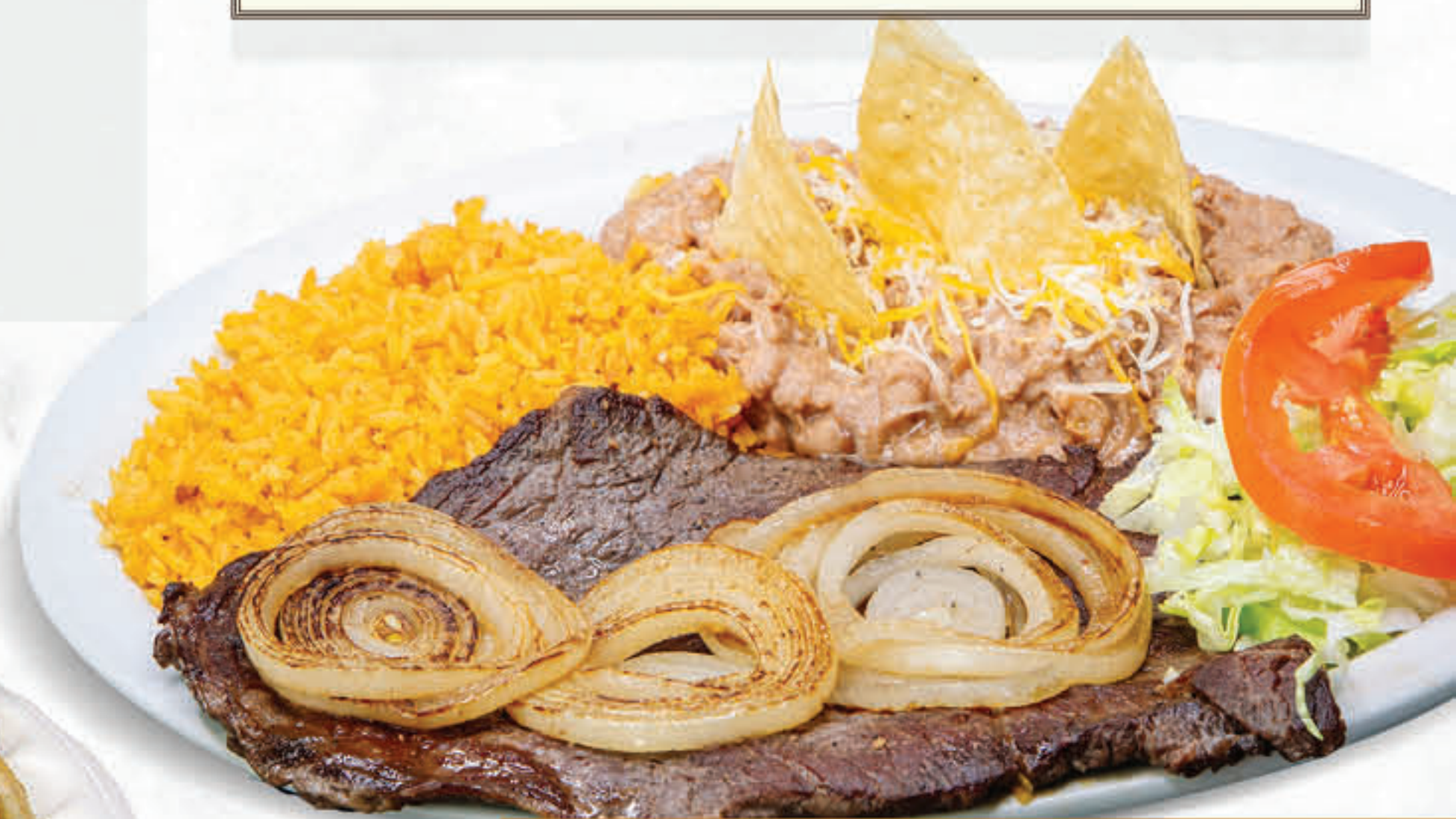
Carne Asada with Onions