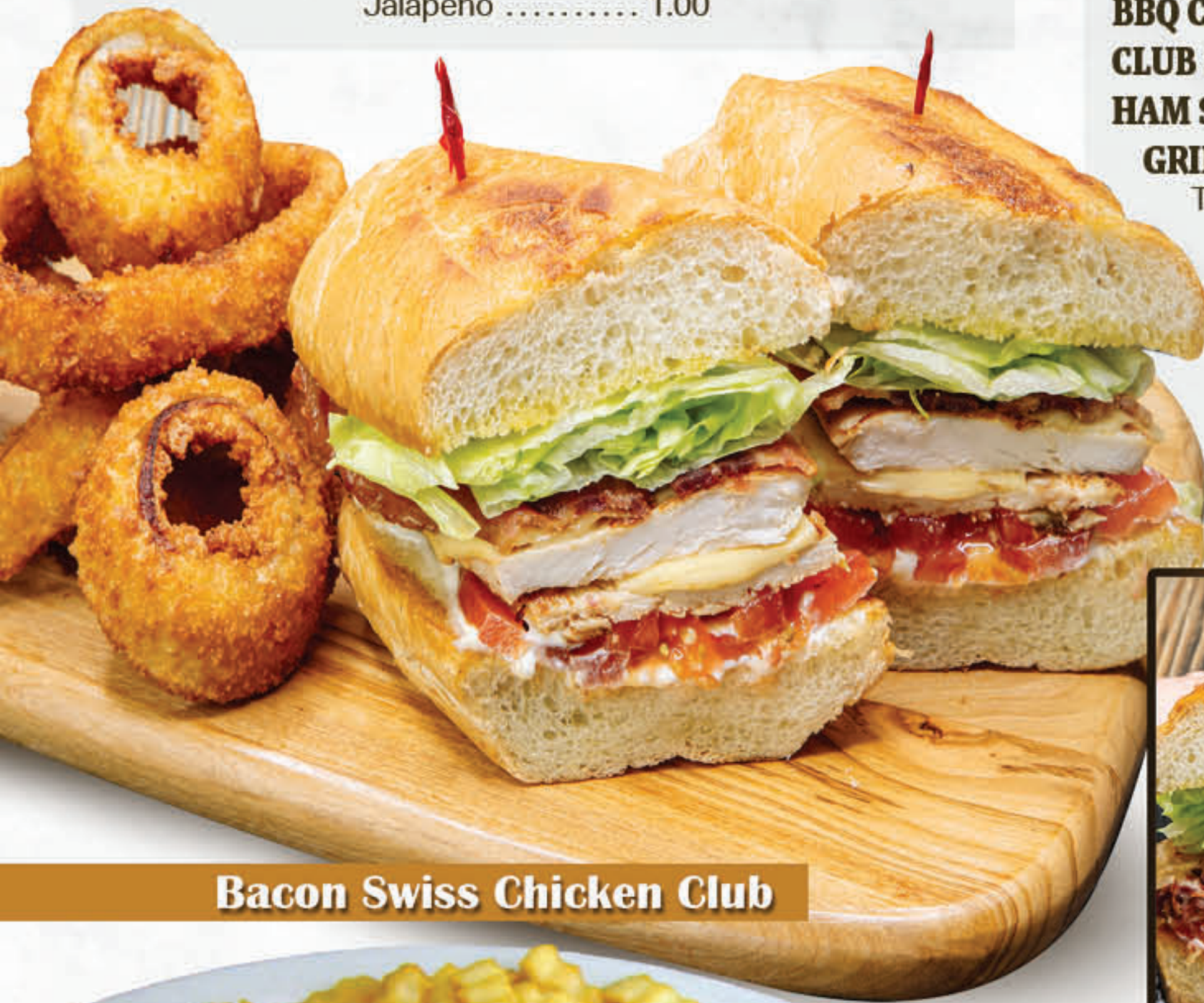
Bacon Swiss Chicken Club