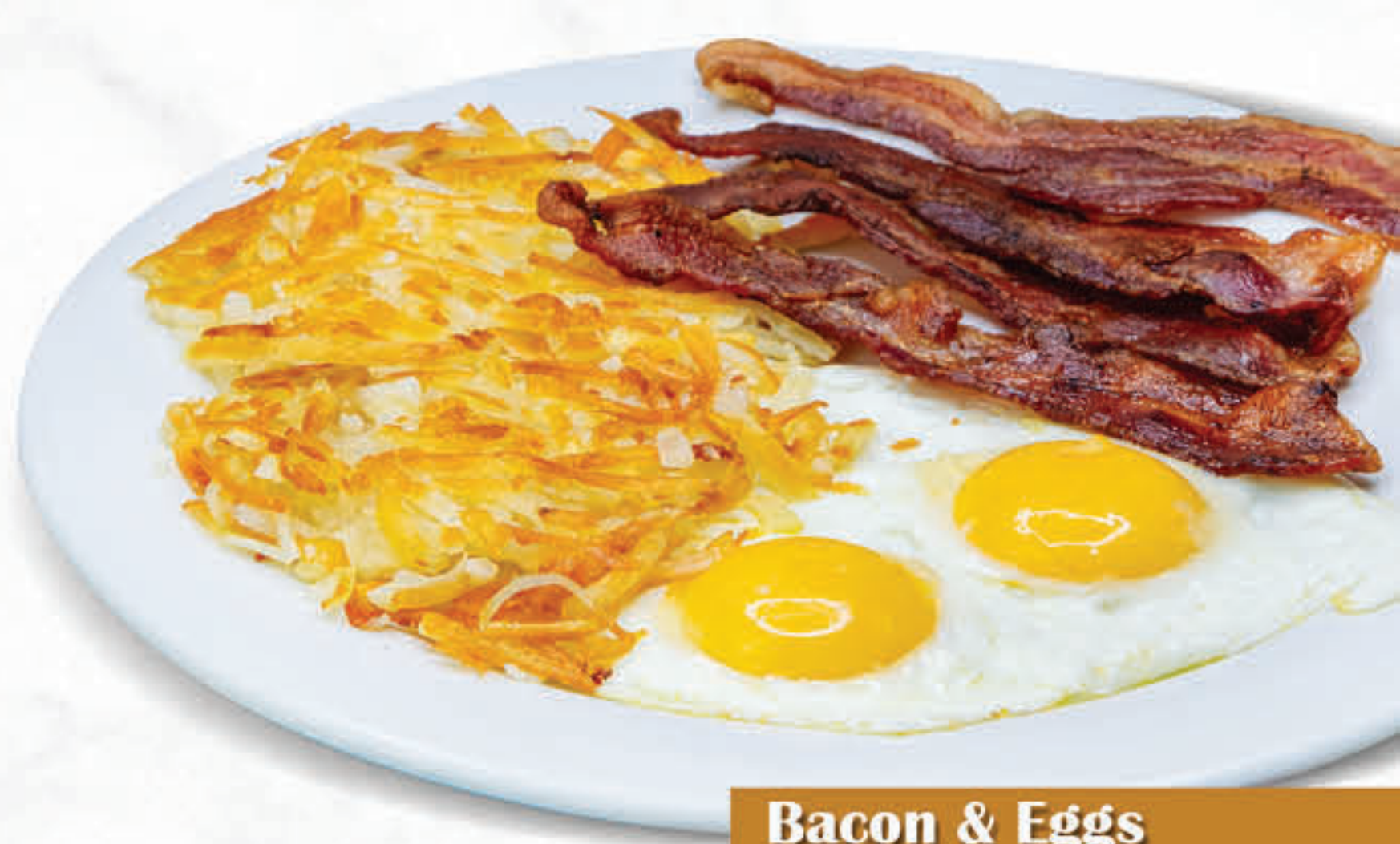
Bacon & Eggs

Served with your choice of toast. Berries or bananas add .99¢