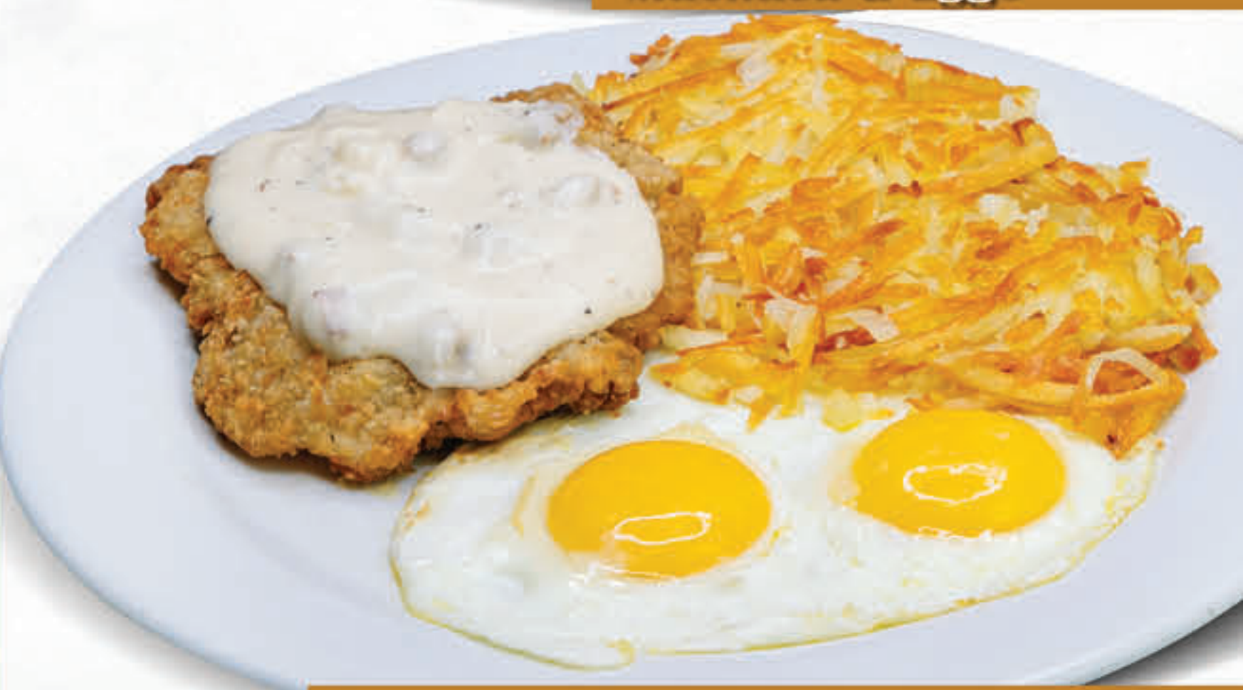
Country Fried Steak & Eggs