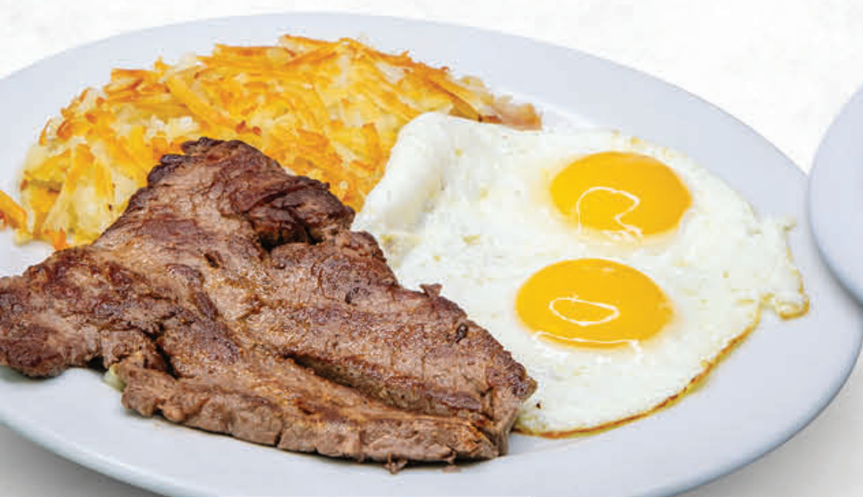
1/2 T-bone Steak & Eggs

WARNING: Consuming raw or under cooked meats, poultry, seafood, shellfish or eggs may increase your risk of food borne illness, especially if you have certain medical conditions. This item may be served raw or under cooked at your request.