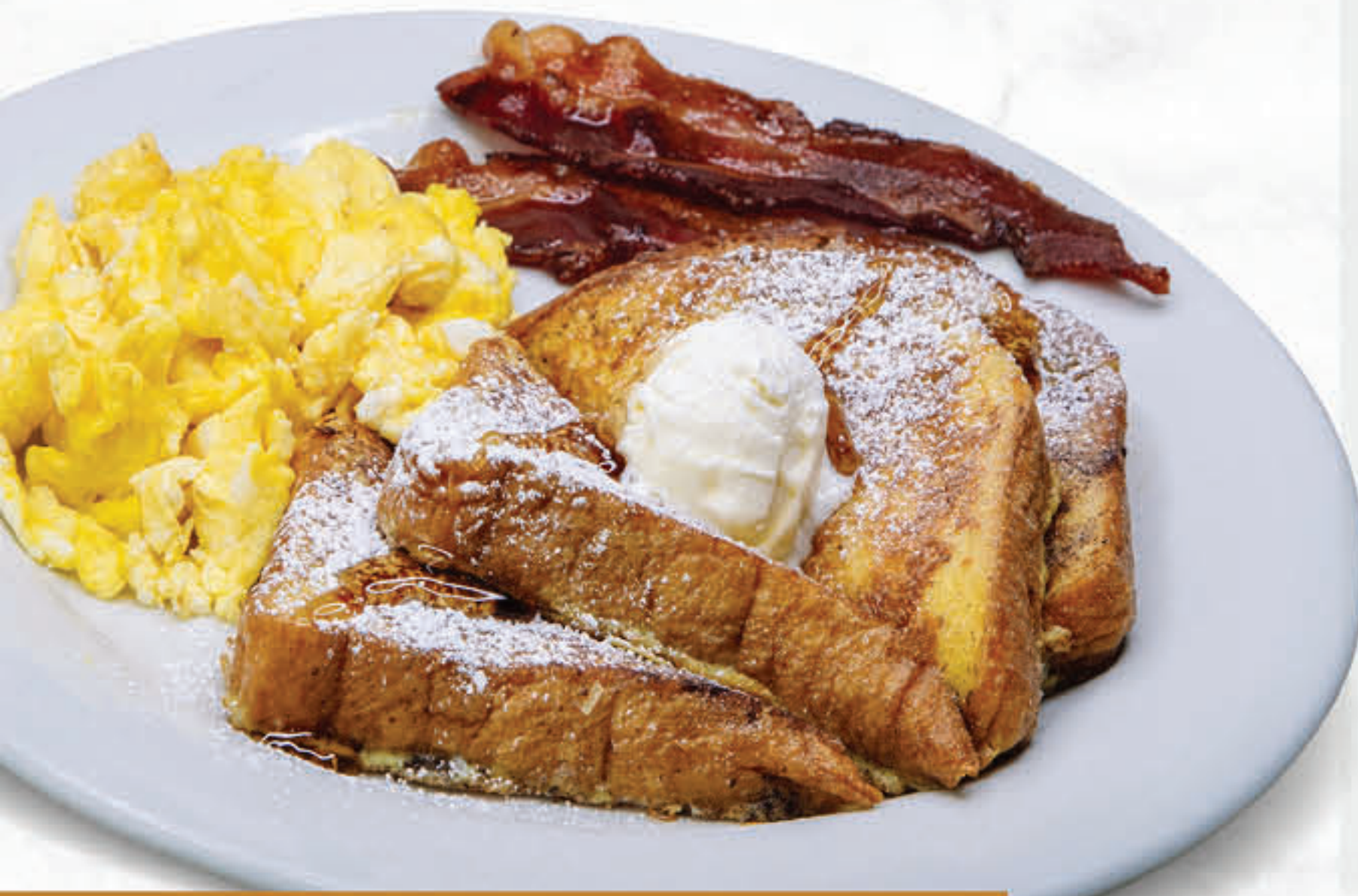
French Toast & Eggs

THREE FRENCH TOAST & TWO EGGS, TWO BACON OR TWO SAUSAGE 12.99