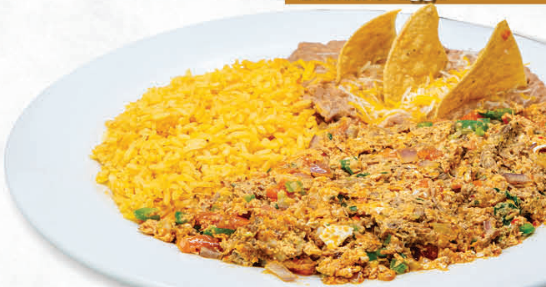
Machaca & Eggs