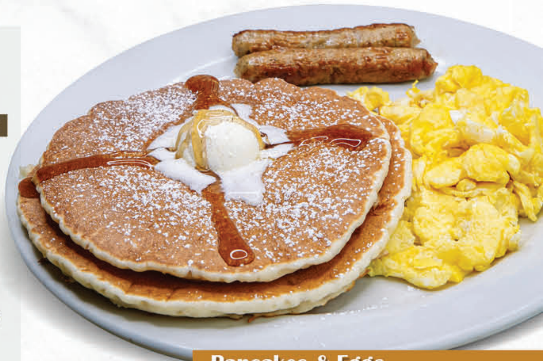
Pancakes & Eggs

BELGIAN WAFFLE A LA CARTE 7.49 WITH TWO EGGS, BACON OR SAUSAGE) COMBO 12.95